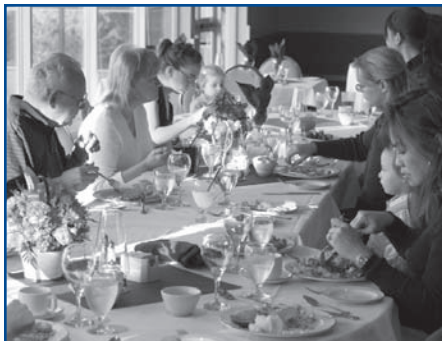
Take some time with your child to enjoy the holidays and listen to their goals, successes and challenges.

Holidays offer a time to listen, reconnect with your college child