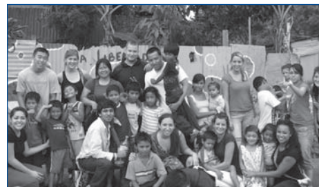
JWU students enjoyed a trip to Costa Rica last summer as part of JWU's Study Abroad programming.