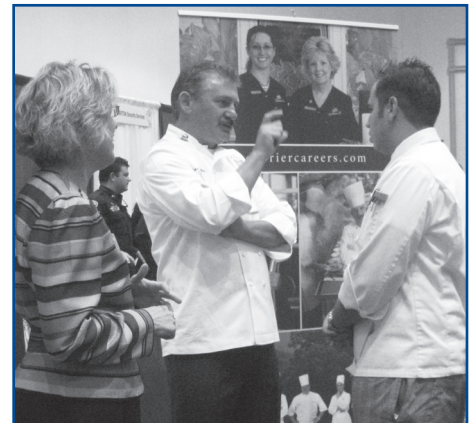
Programs such as Nov. 4's career expo connect JWU students with employers throughout the year.

in mind that some internships provide an hourly wage or stipend in addition to academic credit. Students are encouraged to meet with their experiential education coordinator in Experiential Education & Ca-